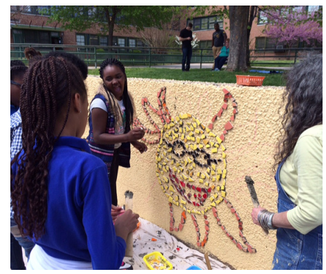
Students at Baltimore's Gilmor Elementary create a mural from rubble.

In the rubble strewn throughout their neighborhood, students found broken pieces of tile from a damaged building. Seeing the beauty in the tiles, the students, teachers, and community partners collected and repurposed the pieces, putting them together to create a mural on a wall near the school's playground.